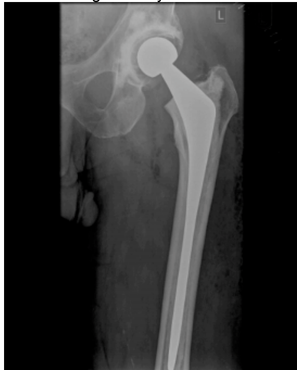
Figure 3. Long stem hip replacement. The aim is to bypass all of the weakened bone.

Unlike normal hip replacements, the stem down the femur needs to be longer to avoid unexpected failure by the bone breaking, or giving way at the tip of the stem. The pelvis side sometimes needs a reinforcing cage. Both components should be cemented. Not all orthopaedic surgeons are comfortable doing this work and might refer you elsewhere.