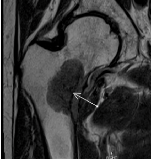
Figure 1. An MRI demonstrating the bone to be weakened by tumour. In this location, the bone is likely to break within days or week

Sometimes bone is weakened by tumour. This can cause severe pain and even fracture of the bone. The diagnosis may be obvious on x-ray, or it can be difficult to diagnose.