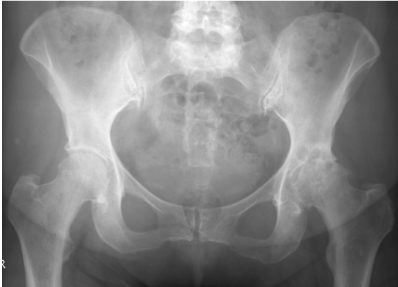
Figure 1. Hip Osteoarthritis. This shows both hips, the one on the left of the page is normal. The one on the right shows the joint space to have gone, there are holes in the bone, and the ball no longer round.

Hip replacement surgery is performed to relieve pain, stiffness, and disability caused by hip arthritis. The most common reason is osteoarthritis. Osteoarthritis occurs from the hip wearing out – often there is an underlying “design fault” in the shape of the hip, or soft bone, or previous injury contributing to it wearing out. The pain is most commonly felt in the groin, but some people get the pain in the thigh, knee, buttock, or a combination.