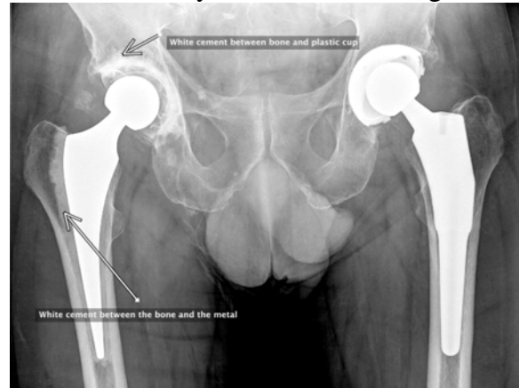
Figure 4. Fully cemented hip replacement on the left side of this image. The bone cement is seen as a white-grey cloud between the implant and the bone.

The first truly successful hip replacements in 1962 were cemented and whilst we no longer use Sir John Charnley’s design, we do use its successor, the C-Stem, and competitor the Exeter. The implants are less expensive, but a longer operation, and slightly increased risk of heart & lung complications. They do slightly reduce bleeding from the bone, and can be used if the bone is very soft with osteoporosis. The skin incision may need to be a bit larger.