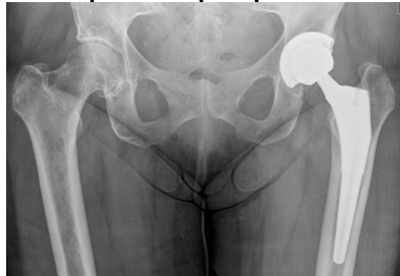
Figure 2. Taperloc Hip Replacement

The Taperloc is a modification of 30-year-old design with a titanium stem and cup that bone "grows on to". The changes to the original design allows for greater variations in shape of patients. The socket is called the G7 and allows the surgeon additional stability options in small patients, and a ceramic liner if required.