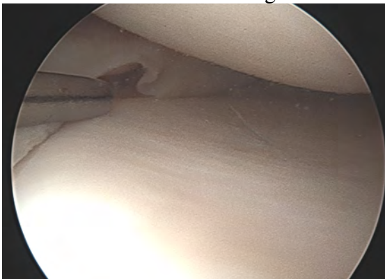
Figure 1. Arthroscopic image of a cartilage infolded fragment under the ligament. When the fragment moves, the symptoms change from night pain to locking. The knee is unpredictable. In this image, a 2mm diameter probe is being used to bring the fragment out of the infolded position.

In young people, usually a significant injury occurred, typically in sport. In older people, the cartilages seem to behave more like old rubber, and more easily split. The forces in heavy people are higher. Some people have bow legs or knock knees, and this increases the force on one of the cartilages.