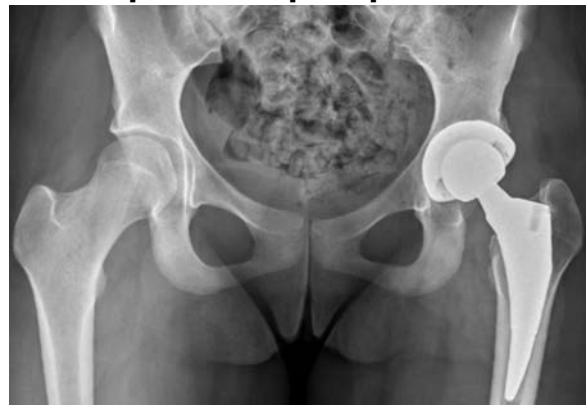
Figure 2. Taperloc Microplasty Hip Replacement

The Taperloc Microplasty is a modification of 30-year-old design with a titanium stem and cup that bone "grows on to". The changes to the original design allows for greater variations in shape of patients. The socket is called the G7 and allows the surgeon additional stability options in small patients, and a ceramic liner if required.