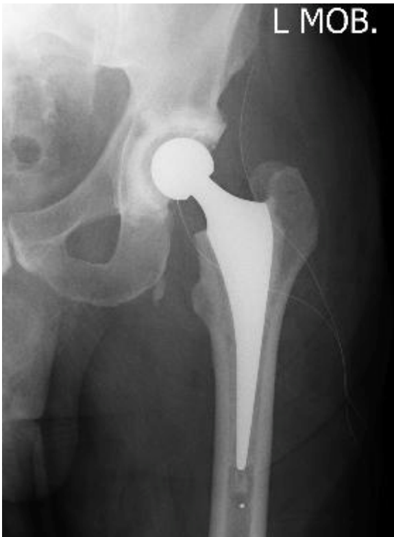
Figure 1. A hip immediately after a single stage revision. The polyethylene cup can't be seen except for a wire marker, and the white bone cement between the cup and the pelvis. The stem is also cemented in place with an antibiotic loaded cement. Large drain tubes in and around the joint are just visible.

A single stage operation does it all in one go. The theory is that a new implant and antibiotic bone cement will restore function faster, although six months of antibiotics by mouth are usually necessary as well.