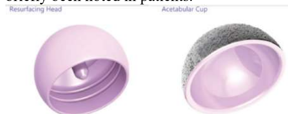
Figure 2. Ceramic resurfacing components – titanium on outer aspect of acetabular component.

Ceramic on ceramic could have fractures of the implant (one has occurred in the UK) or squeaking – which so far has only been briefly noted in patients.