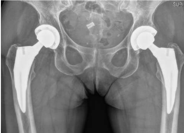
Figure 3. The Taperloc Microplasty hip.

This design is 30 yrs old with some recent improvements. It uses a polyethylene articulation made with a special process called E-Poly, with proven wear characteristics. I use this for people with metal sensitivity, as the stem is made with titanium, and the bearing surface can be ceramic. The short stem might reduce thigh pain incidence, but has not made it zero.