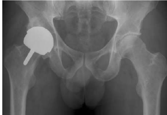
Figure 1. A Birmingham resurfacing showing the femoral neck has been retained, the head resurfaced, and bone preserved.